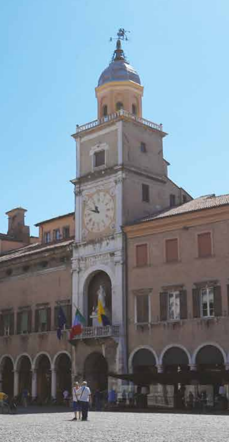
From left to right: Palazzo Comunale, Moza Tower room, Chamber of the Confirmed, Fire room, Room of the Old Council, Tapestries room, Modena Coat of Arms in the Wedding room.