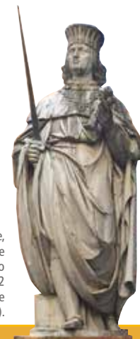
Borso d'Este, sculpture by Ferdinando Pelliccia, 1882 (Courtyard of the Palazzo dei Musei).

Founded in 1872 thanks to the bequest by architect Luigi Poletti, this library specialises in architecture and art and also has a large section of ancient (sixteenth-nineteenth century) books, prints, drawings, photographs, and geographical maps, as well as art and architectural archives and an important collection of artists' books.