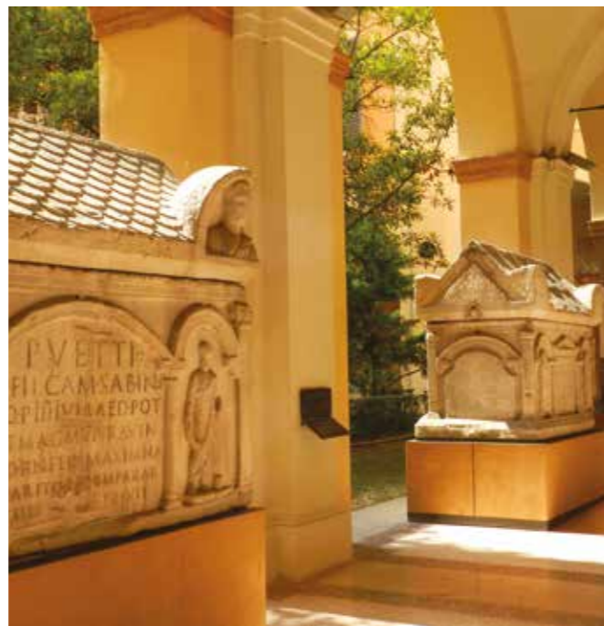
Sepulchral monuments (Estense Lapidary Museum).