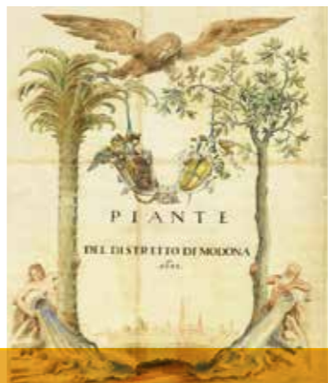
Plants of the District of Modena by Giovan Battista Boccabadati, 1687 (Municipal Historic Archive).

Repository and deposit for documents produced by the community over the centuries, a point of reference for those wanting to study the history and culture of the city and its surrounding area. It organises seminars, temporary exhibitions and educational workshops.