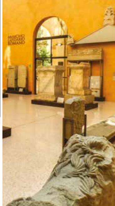
Roman Lapidary of the Civic Museums.