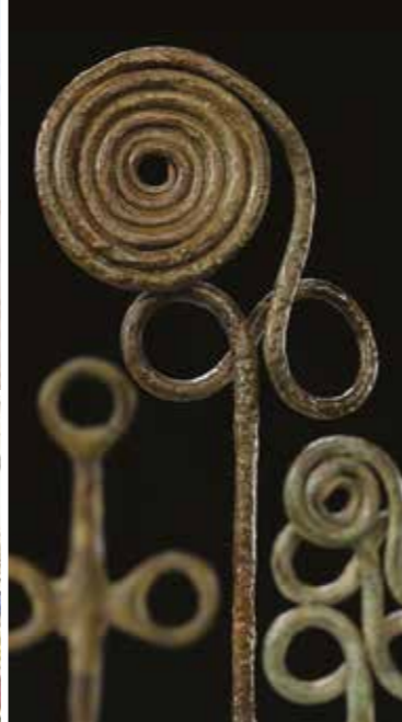
Bronze pins from the terramare, 1550-1250 B.C. (Civic Museums).

Estense University Library Originally the Este family's private library, it had illustrious librarians such as Muratori and Tiraboschi. In 1764, Duke Francis III opened it to the public. It houses miniatures, manuscripts, geographical maps, incunabula, and illuminated codices, including the Borso d'Este Bible (1455-1461). With the Unification of Italy, it was merged with the University Library to form the "Estense University Library". Moved to the Palazzo dei Musei in 1882, since 2016 it has been part of the "Estense Galleries".