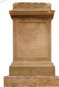
Detail of the Altar of Vetilia Egloge, 1st century A.D. (Roman Civic Lapidary Museum).