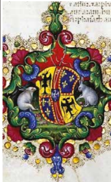
Details of the Bible by Borso d'Este, 1455-1461 (Estense University Library).

Estense University Library Originally the Este family's private library, it had illustrious librarians such as Muratori and Tiraboschi. In 1764, Duke Francis III opened it to the public. It houses miniatures, manuscripts, geographical maps, incunabula, and illuminated codices, including the Borso d'Este Bible (1455-1461). With the Unification of Italy, it was merged with the University Library to form the "Estense University Library". Moved to the Palazzo dei Musei in 1882, since 2016 it has been part of the "Estense Galleries".