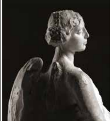
Angel by G. Graziosi, 1924 (Graziosi Plaster Cast Gallery).

Civic Museums Founded in 1871, the Civic Museum houses a wide variety of different collections. The Museum of Archaeology documents the historical development of the city and surrounding area from the Palaeolithic to Medieval times. It houses material from the terramare (villages in the Bronze Age), findings from the Neolithic Age and relics linked to the Celts, Etruscans and Romans. The Ethnology section features a display of materials from travels and exploration (from New Guinea to South America) and pre-Colombian textiles. The Art Museum houses an exhibition of musical and scientific instruments, pottery, glassware, arms, decorated paper, architectural terracotta, weights and measures, the Gandini collection of textiles, sculptures, fragments of frescoes from the eleventh and twelfth centuries, liturgical furnishings and paintings from the Middle Ages to the eighteenth century. The Campori and Sernicoli collections in particular illustrate the Baroque period in Emilia with works by important painters.