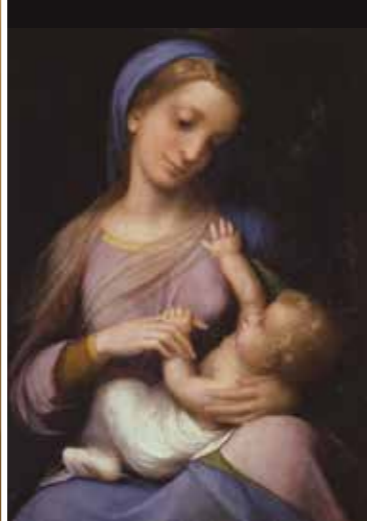
Madonna and Child by Antonio Allegri, called Il Correggio, 1517-1518 (Estense Gallery).

Estense Gallery The Estense Gallery houses a display of drawings, bronzes, pottery, musical instruments and medals belonging to the Este Family. There are also paintings from the fourteenth to the eighteenth century, including Renaissance works from Modena, of the Flemish School, by Correggio and Velázquez. The sculptures include: the Bust of Francis I d'Este, a masterpiece by Gian Lorenzo Bernini and various pieces by Antonio Begarelli.